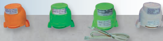
Compatible with all Zonemaster & Polyaire Motors