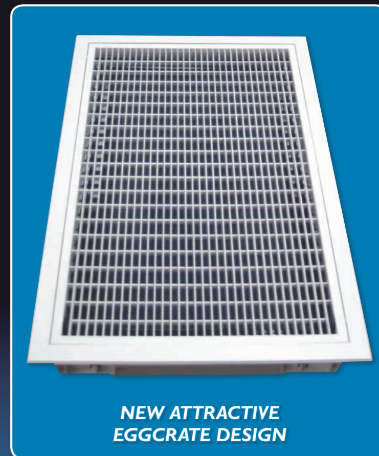
NEW ATTRACTIVE EGGCRATE DESIGN