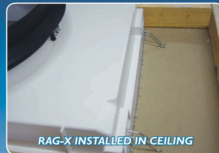
RAG-X INSTALLED IN CEILING