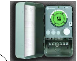
Frost build up Defrost Control